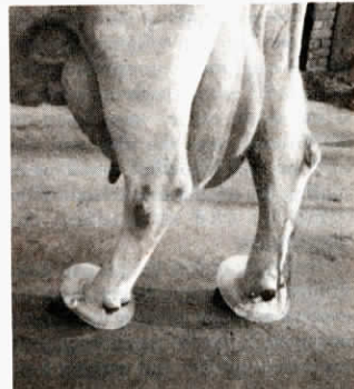
Plastic rings, worn on the rear legs, lift the teats up and out of the way when the cow gets up.

For more information, contact: FARM SHOW Followup, Recipro-Prof, Division, Lanark Farm Equipment, Pakenham, Ont. KOA 2X0 (ph 613 624-5393).