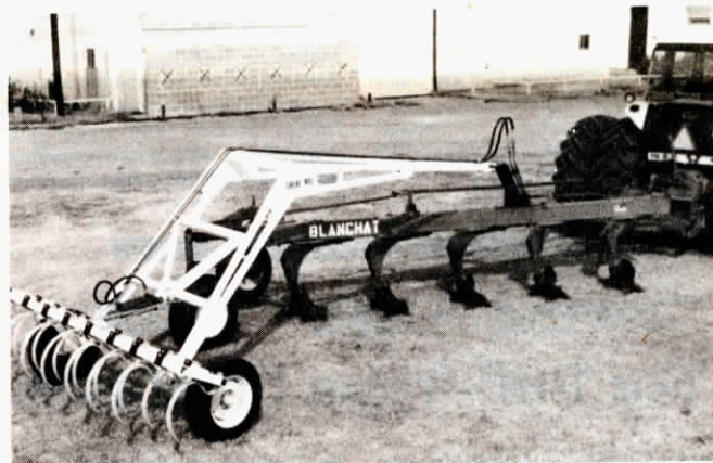
Ghere cultivator levels the ground right behind the plow, sealing in moisture.

For more information, contact: FARM SHOW Followup, Ghere Mfg., Danville, Kan. 67036 (ph 316 962-5291).