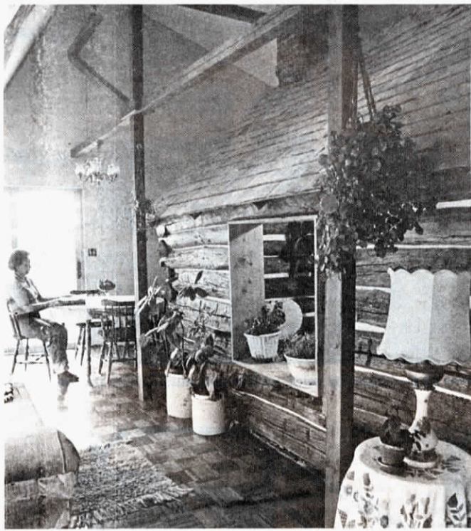
The Trussells built an addition to their home around a 130 year old log cabin.