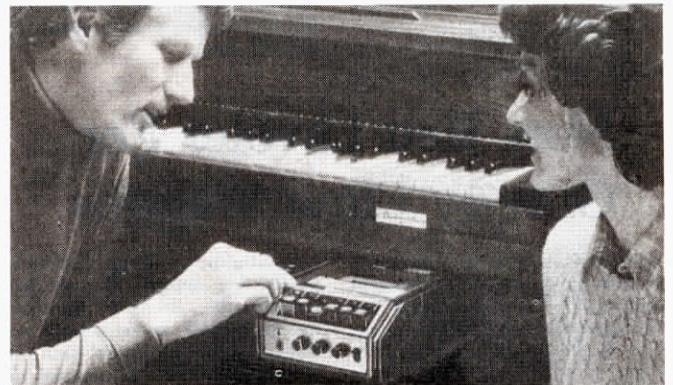
Plop in a cassette and piano keys actually play the tune — with help from a computer.

The Pianocorder kit can be installed on any piano — old or new, upright or grand — so long as it's in good working order. Skilled technicians do the installation. No on-going maintenance is required, although