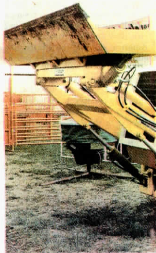
Blade tilts back to full horizontal to serve as bucket.

For information, contact: FARM SHOW Followup, Jan Hoopman, Hoopman Machines, POB 9, 7120 AA, Aalten, Holland (ph 05436-224 ext. 331).