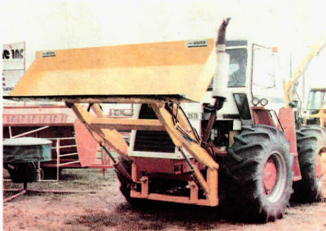
The 14 ft. blade holds about 2½ yds. and lifts about 7 ft. into the air for dumping.

The standard-size feed bucket sells for around $3,000 for two-sided un-