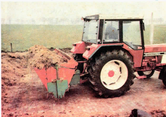
Side-unloading mixer model has built-in beater which provides 100% mix of silage and grain.

EQUIPPED WITH A SIDE-UNLOADING AUGER, IT ALSO HAULS MANURE, DIRT OR SNOW